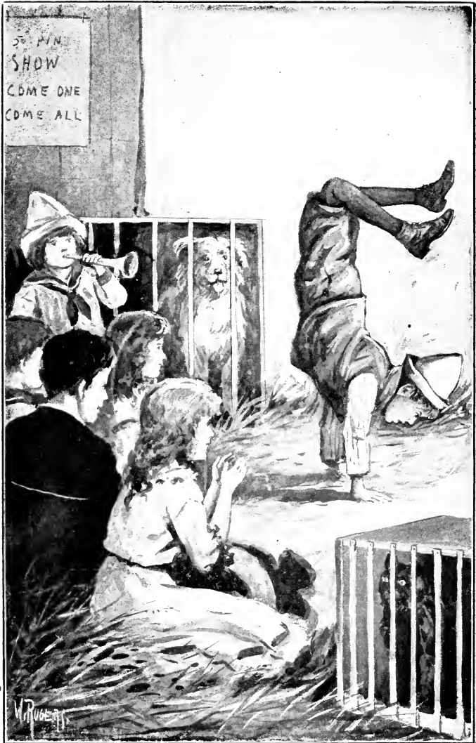
BURT WAS VERY FUNNY AS A CLOWN, AND HE TURNED SOMERSAULTS IN THE HAY.